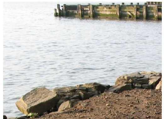
Alpine is on the west side of the Hudson at Hudson River Mile 18.