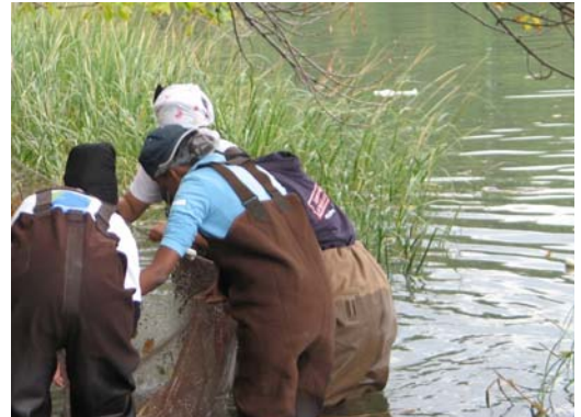
Inwood Hill Park is near Hudson River Mile 14.

Mummichogs prefer areas where water plants grow.