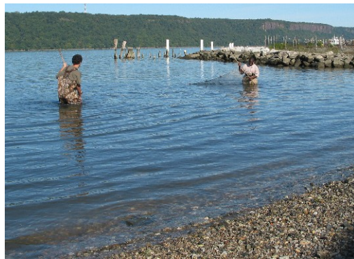
Yonkers is on the east side of the Hudson at Hudson River Mile 18.