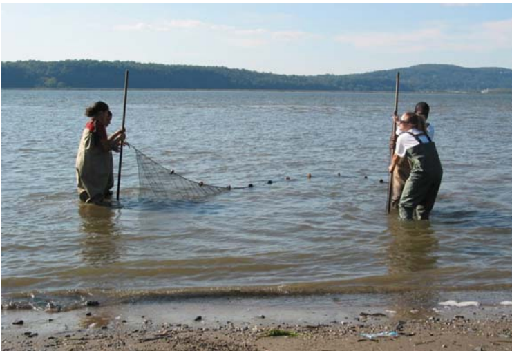
Seine nets can be used to catch fish in shallow water.

During the Day in the Life of the Hudson River event each fall, students catch fish at many places along the river. Then they compare results to see where different kinds of fish live. The location of each place is given in Hudson River Miles . River Mile 0 is in New York City. Going north towards Albany, the mile numbers get higher. Yonkers is at Hudson River Mile 18. Beacon is at Hudson River Mile 61.