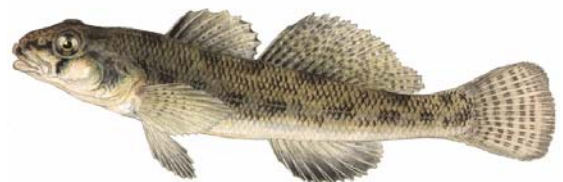
(b) tessellated darter Fresh