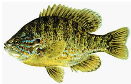
(c) pumpkinseed Fresh